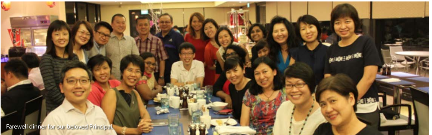
Farewell dinner for our beloved Principal.