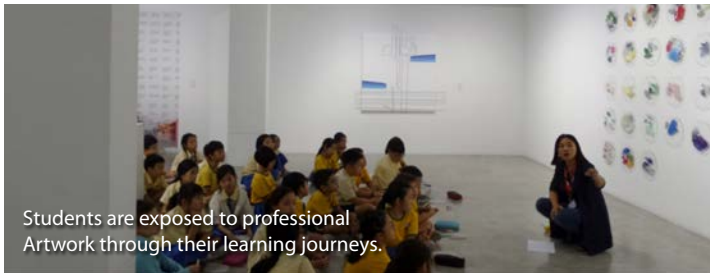
Students are exposed to professional Artwork through their learning journeys.