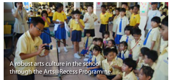
A robust arts culture in the school through the Arts@Recess Programme.