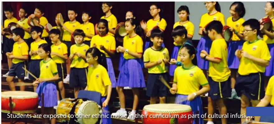
Students are exposed to other ethnic music in their curriculum as part of cultural infusion...