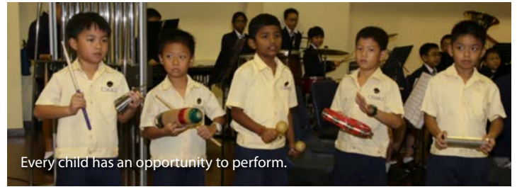
Every child has an opportunity to perform.

Fairfield Methodist School Primary has clinched the prestigious BLAZE award in the National Arts Education Award (NAEA) 2015. This award is conferred to schools with a comprehensive programme to develop aesthetics appreciation amongst its whole school population, while providing additional opportunities to develop the abilities of those aesthetically-inclined via Aesthetics CCA activities and other enrichment activities.