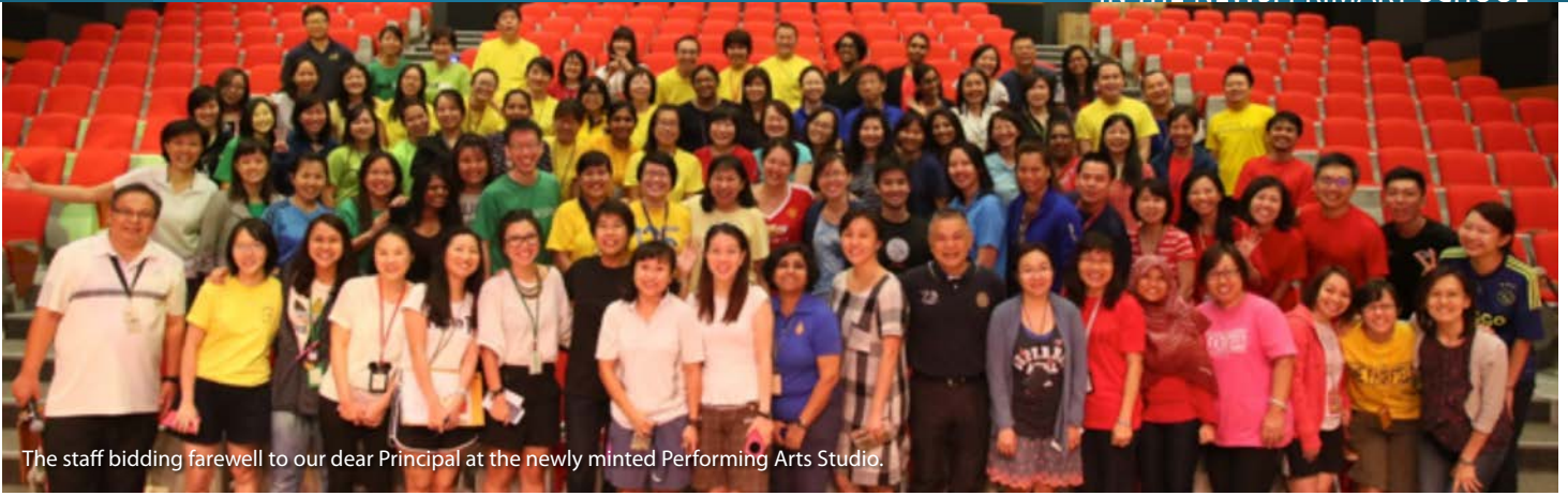
The staff bidding farewell to our dear Principal at the newly minted Performing Arts Studio.