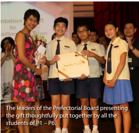
The leaders of the Prefectorial Board presenting the gift thoughtfully put together by all the students of P1 – P6.