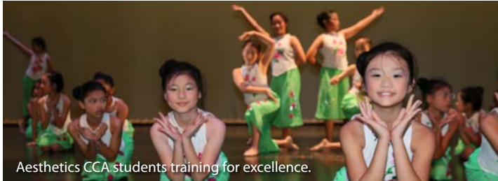
Aesthetics CCA students training for excellence.