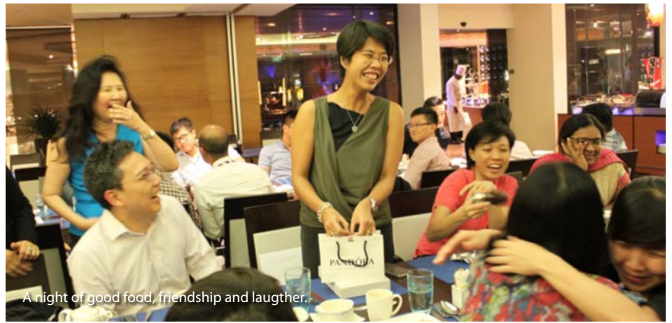
A night of good food, friendship and laughter.