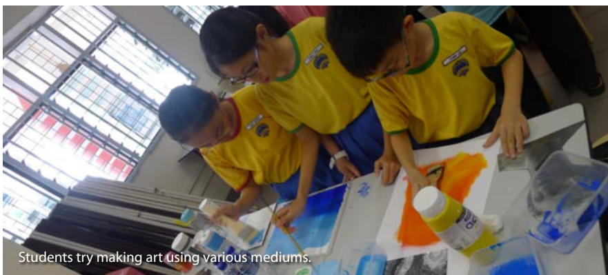
Students try making art using various mediums.