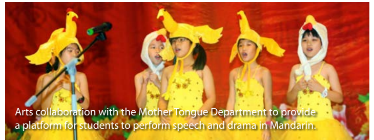
Arts collaboration with the Mother Tongue Department to provide a platform for students to perform speech and drama in Mandarin.