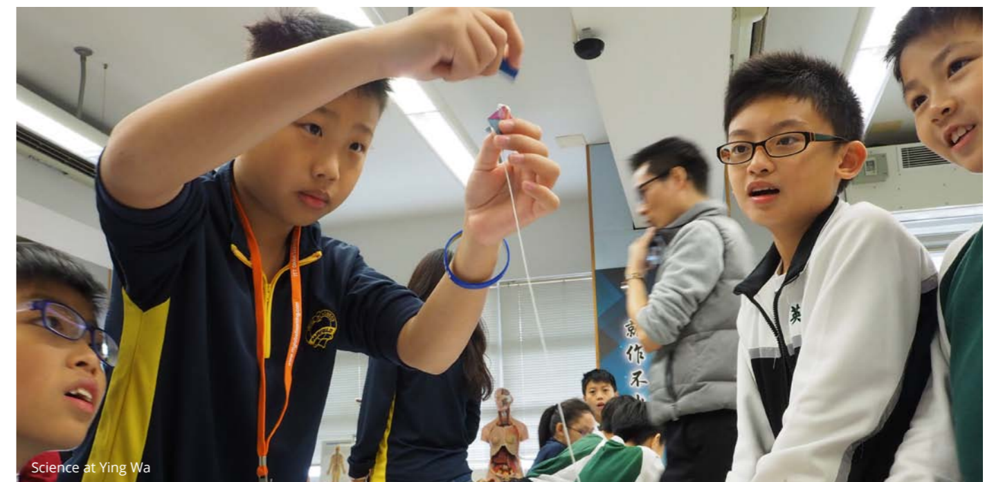
Science at Ying Wa