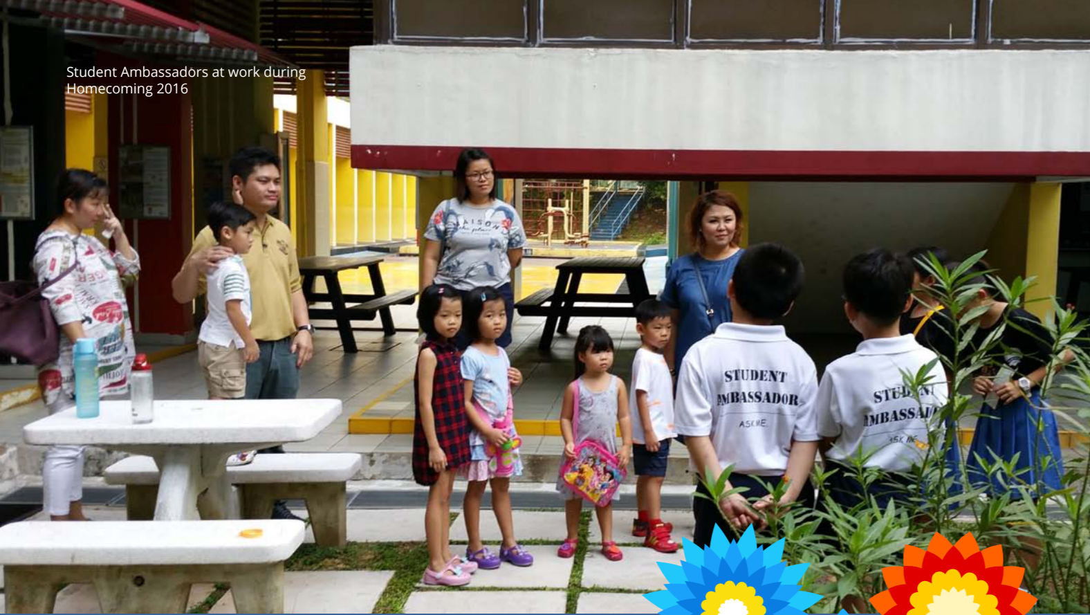
Student Ambassadors at work during Homecoming 2016