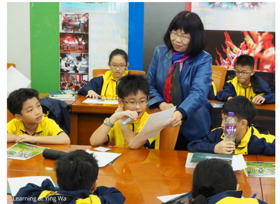
Learning at Ying Wa