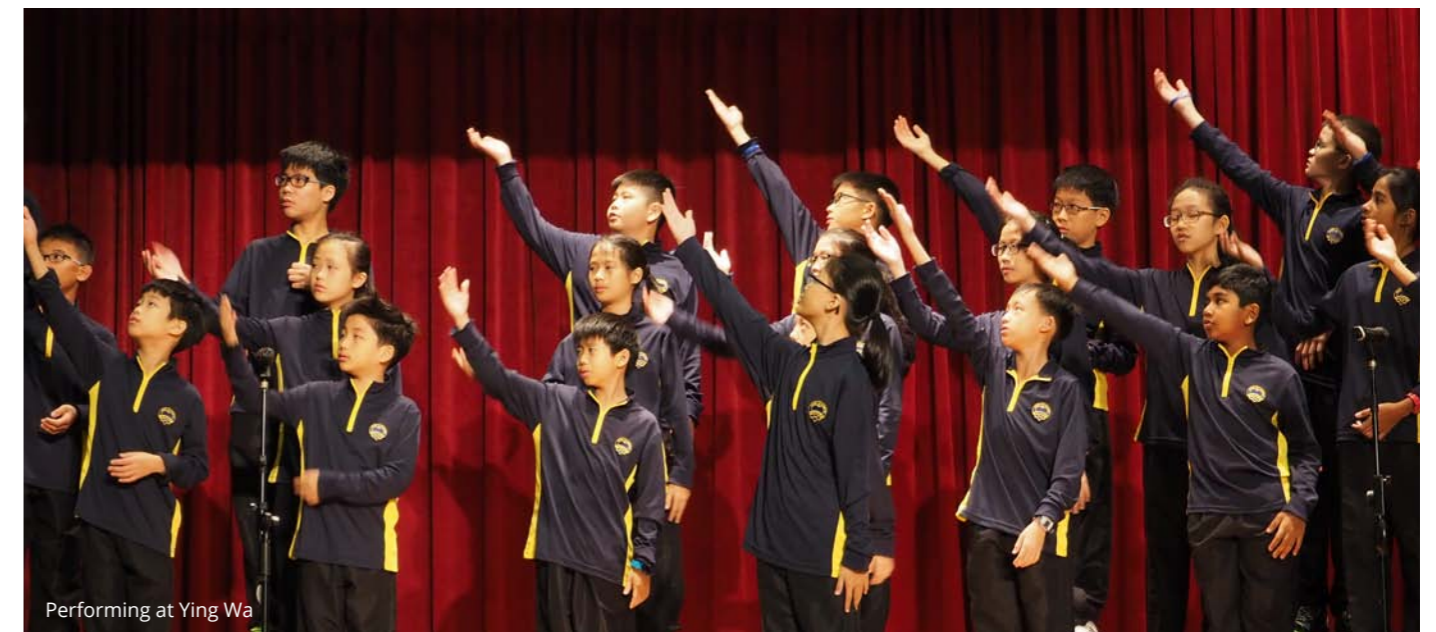
Performing at Ying Wa