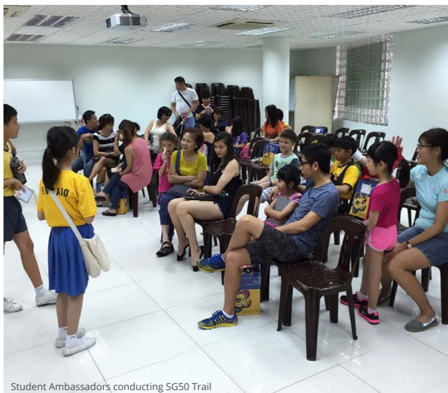
Student Ambassadors conducting SG50 Trail

In talking to guests about the school, the Student Ambassadors have displayed good communication skills. With enthusiasm, willingness and hard work, they explain the history of the school to visitors as well as talk about the interesting learning spaces within the school. They give of their time and effort to bless others with joy. It is for this very reason that they are a blessing to us. Through the Fairfield Reporters and Ambassadors Programme, students learn