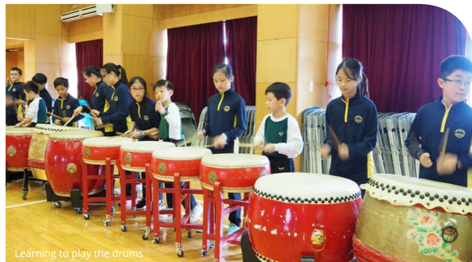
Learning to play the drums

After the tour, the Fairians were introduced to their buddies for the next two days. Then, the students were led to their classrooms for lessons. Apart from the English lessons, all the other subjects were