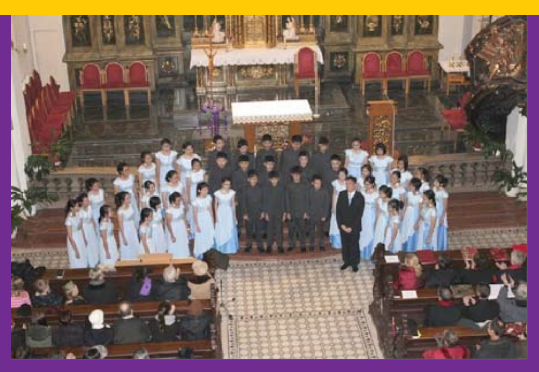
Fairfield Choir's performance at the Jesuit church in Bratislava, Slovakia.

Fairfield Choir felt humbled at the opportunity to take part in the competition even as we received a Silver-band award. However, the experience we gained performing overseas was invaluable, as we learnt various vocal techniques to improve our choral standards in preparation for 2011's Singapore Youth Festival.