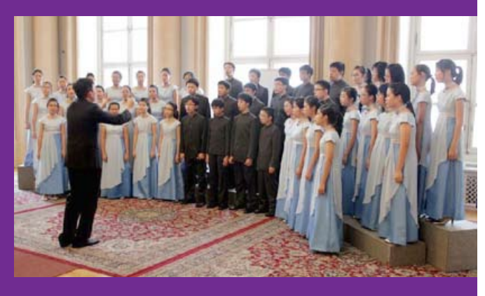
Fairfield Choir competing at the 5th International Festival of Advent and Christmas Music Competition 2010.

we learnt to work together as a disciplined and cohesive team, and sought to improve our musical standards and develop mental strength to overcome future challenges.