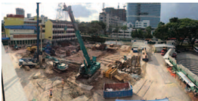
June 2014: Piling works underway