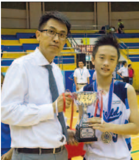
Fairfield Basketball's 'C' Division Boys Finished Second in South Zone Basketball Championships 2014

In the recent Inter-School South Zone Basketball Championships 2014, Fairfield Methodist School (Secondary)'s 'C' Division Basketball team emerged as First Runner-Up. On their way to the finals, the 'C' division basketball team had defeated powerhouses like Raffles Institution and Peicai Secondary School.