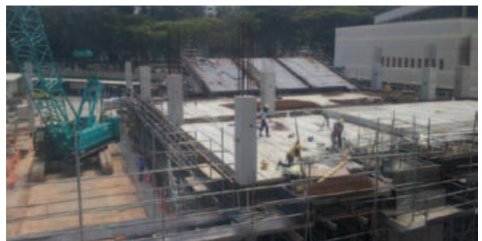
The Performing Arts Studio and Music Rooms in the making