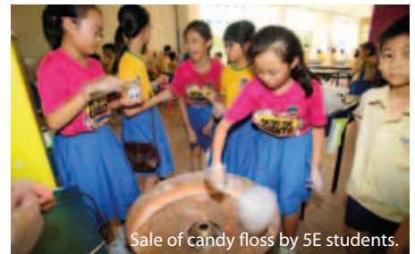
Sale of candy floss by 5E students.