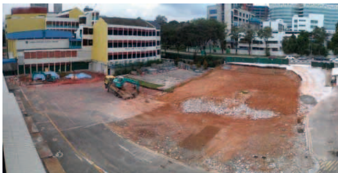
April 2014: The plot of land (which includes the former Caltex Petrol Station) for our extension

Leave a legacy either in your name, your class or in memory of someone. For enquiries, please contact the Primary School at 67788431 or fmsp@moe.edu.sg .