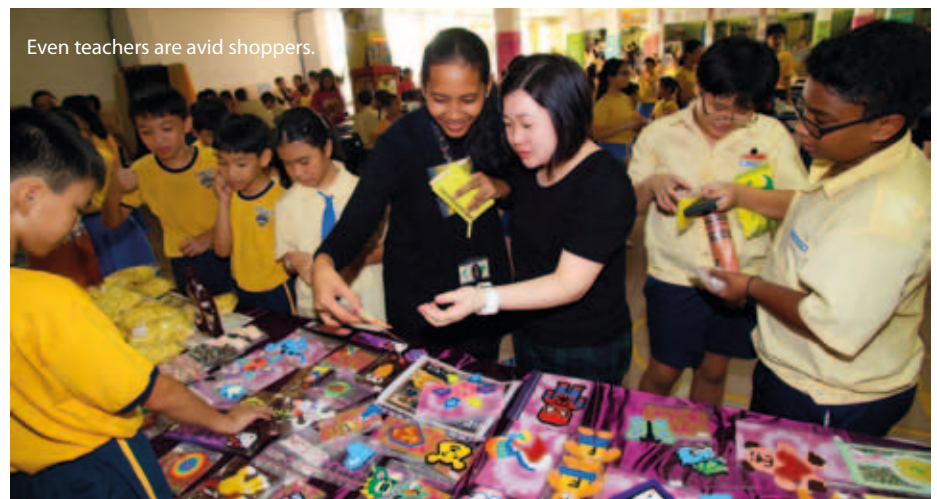
Even teachers are avid shoppers.