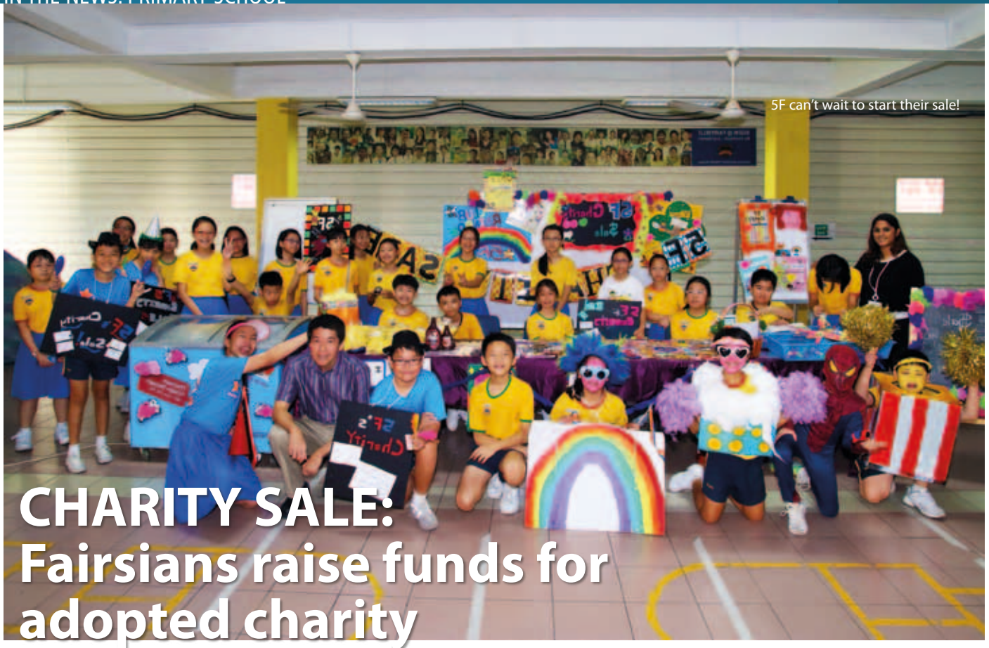
5F can't wait to start their sale!