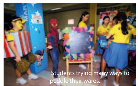
Students trying many ways to peddle their wares.