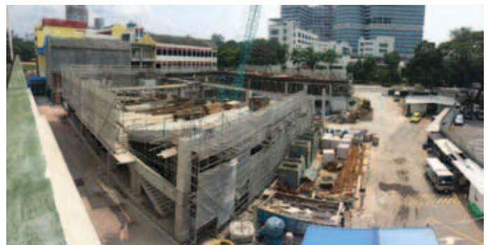
October 2014: The new extension emerging