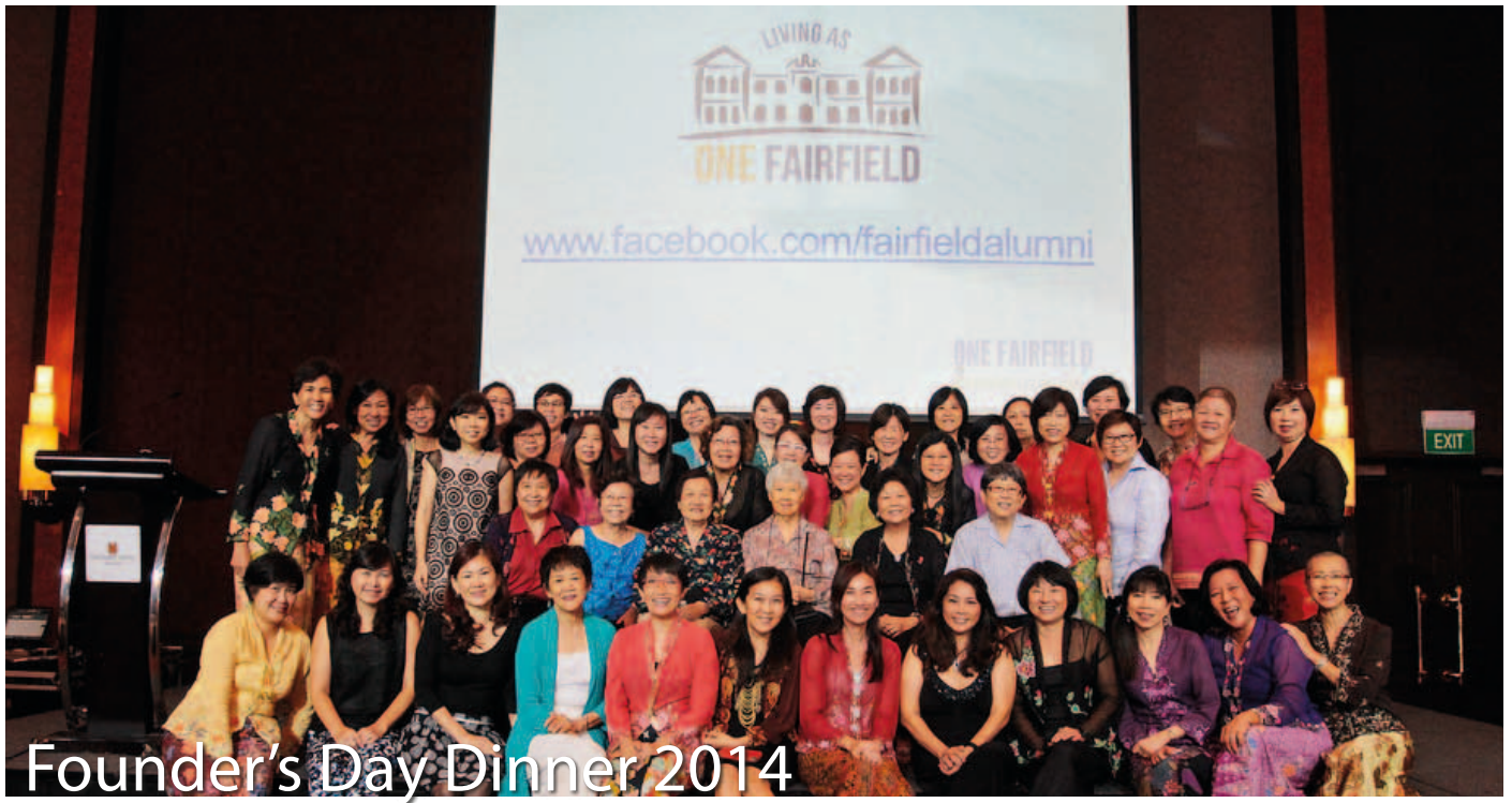
Founder's Day Dinner 2014