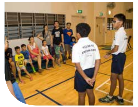
All in all, the Fairfield Homecoming event was an incredible success, thanks to the organisers and the Fairsians who turned up. It was indeed a memorable day as the students and their families were able to spend time bonding with one another. The sense of school pride was also palpable in the air. The experiences of this event convince us that the faith, traditions and culture unique only to Fairfield must be sustained and passed on to future generations.