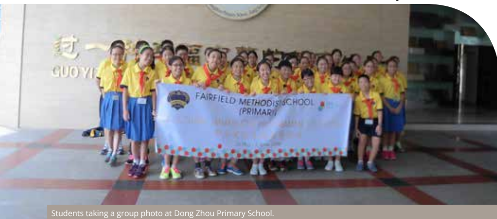
Students taking a group photo at Dong Zhou Primary School.