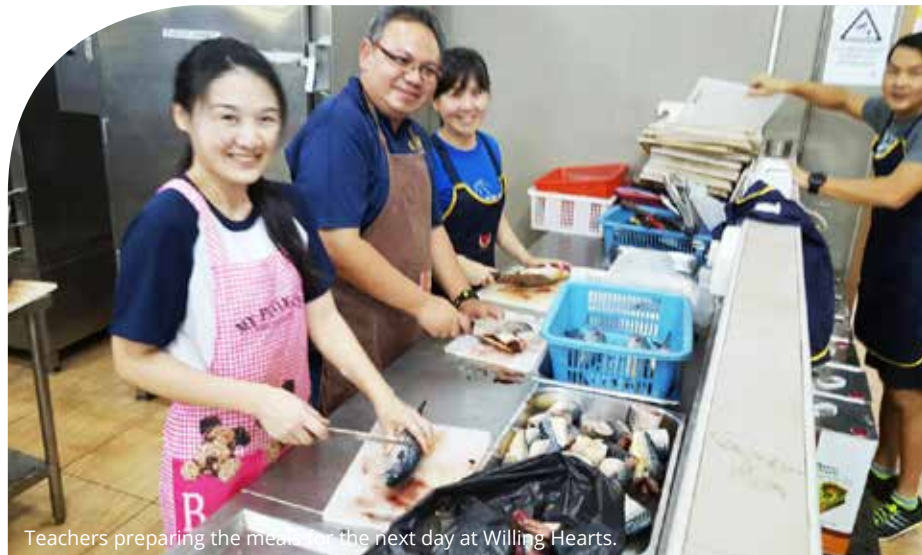
Teachers preparing the meals for the next day at Willing Hearts.