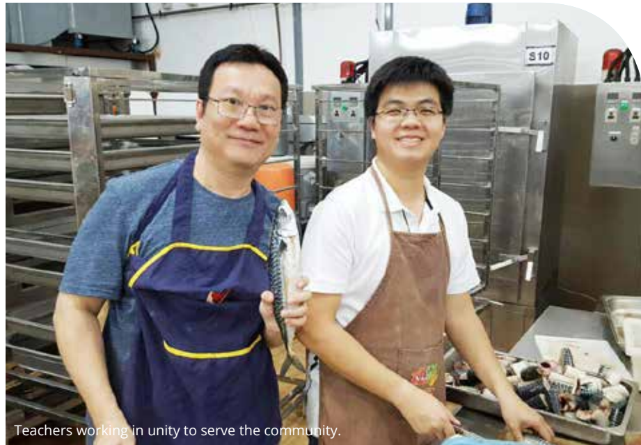
Teachers working in unity to serve the community.

'A Fairsian Leads with Character, Serves with a Heart' – this was echoed in the actions of teachers when they went out to serve the community on 31 May 2016. As part of staff professional week, when teachers normally use the first week of the June holidays to meet to review their work plans at mid-year, Fairfield teachers took time to reach out to the community. Working in 3 groups, the Principal, Vice-Principals, Department Heads and teachers visited Orange Valley Nursing Home, Lion Befrienders Senior Activity Centre and Willing Hearts.