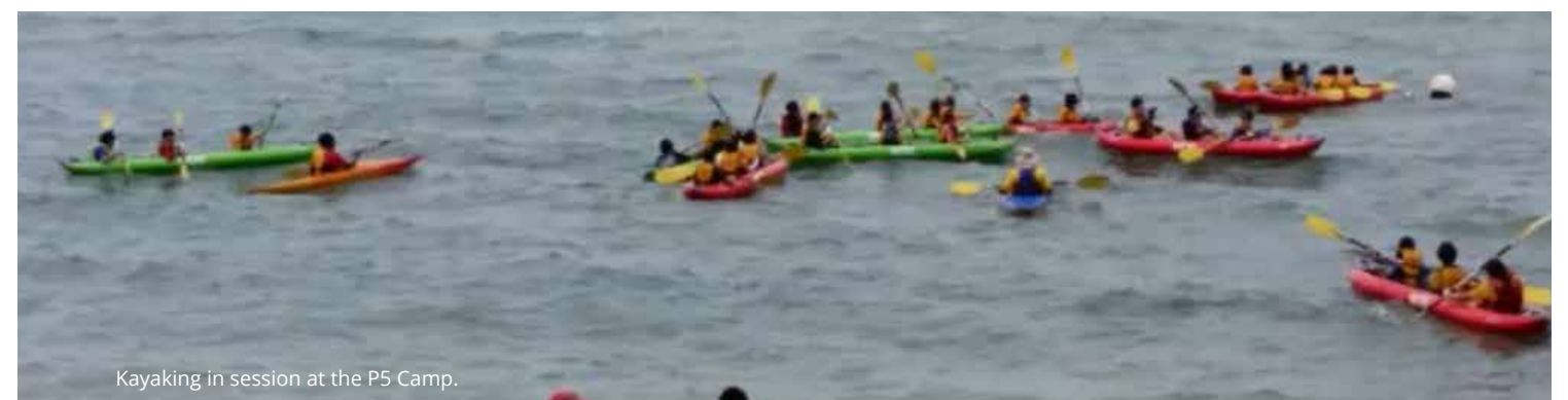
Kayaking in session at the P5 Camp.