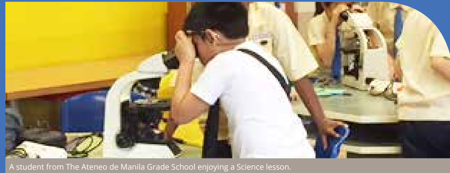
A student from The Ateneo de Manila Grade School enjoying a Science lesson.