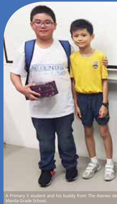
A Primary 5 student and his buddy from The Ateneo de Manila Grade School.

Answer B: I like how the students can be themselves and yet show respect for their teachers.