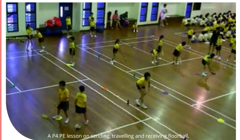
A P4 PE lesson on sending, travelling and receiving floorball.