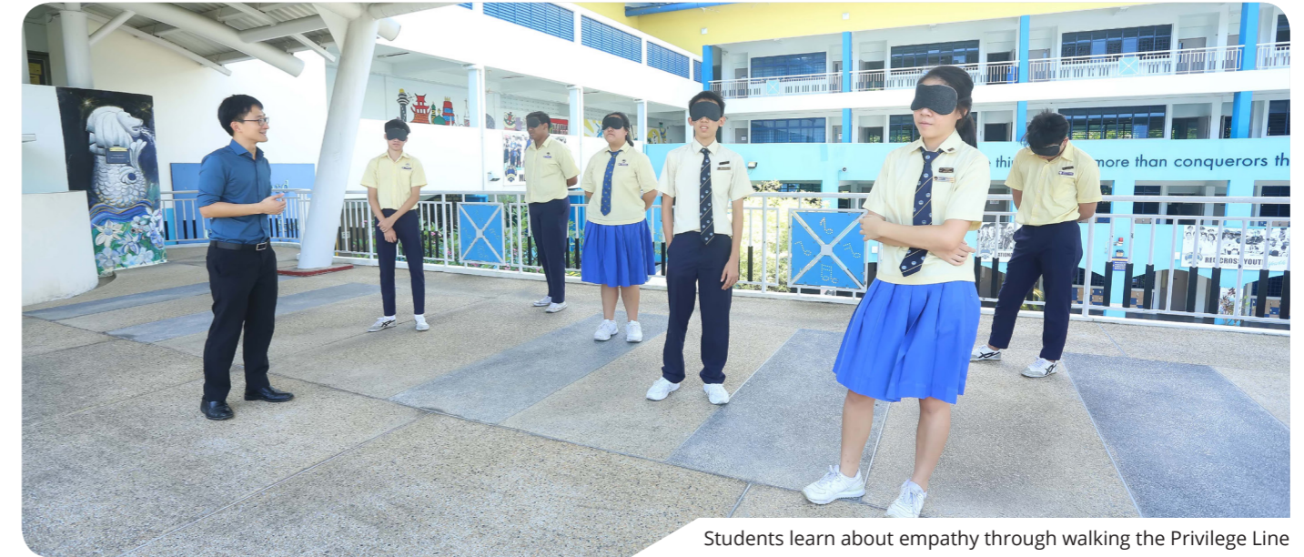
Students learn about empathy through walking the Privilege Line

In my mission to create a safe zone for my students to learn and grow, I try to open my students' eyes to inequality in our society. In one Social Studies lesson, I carried out the 'Privilege Line' social experiment, where students take steps forward and back in response to statements that relate to race, privilege, and gender. Through the activity, they learned to better empathise with others.