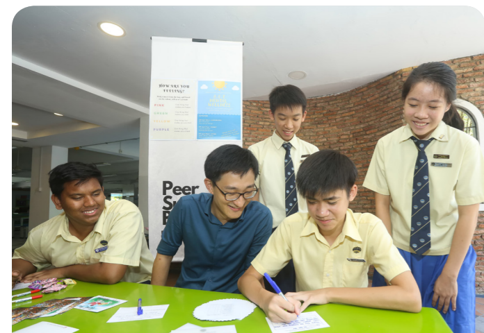
Students writing postcards to show appreciation to their parents