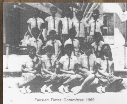
Fairsian Times Committee 1969.