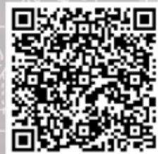
Scan Me to read more about it!