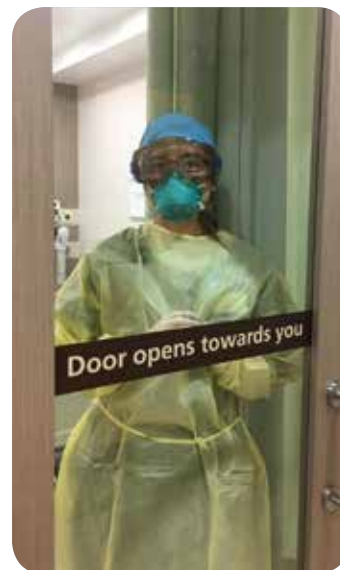
The hospital's strict infection control measures require us to be fully clad in Personal Protective Equipment (PPE) for the safety of both patients and staff.